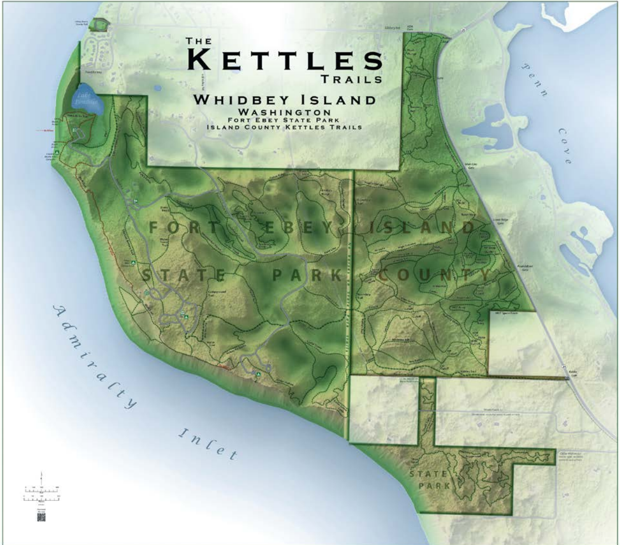
Map 2 - Kettle's trail map system