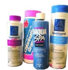
Pool & Spa Supplies