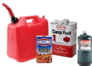
Gasoline & Fuels