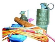
Explosives Contact Washington State Patrol 360-478-4646