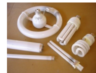
Fluorescent Tubes & Bulbs