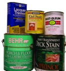
Oil-Based Paints, Stains, & Solvents