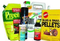
Lawn & Garden Products