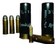
Ammunition Contact local gun clubs