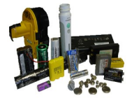
Batteries Button Cell, Lithium, & Rechargeable