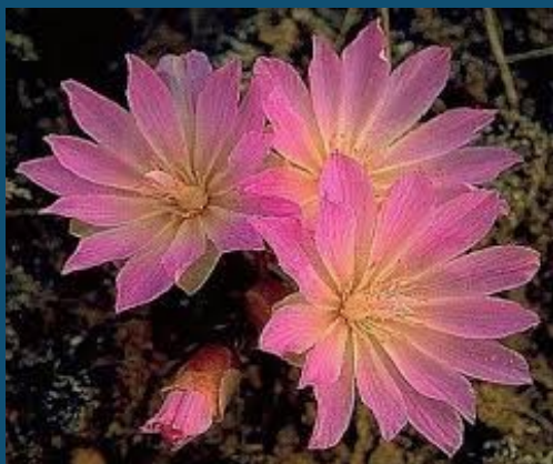
Bitter Root ( Lewisa ssp. )