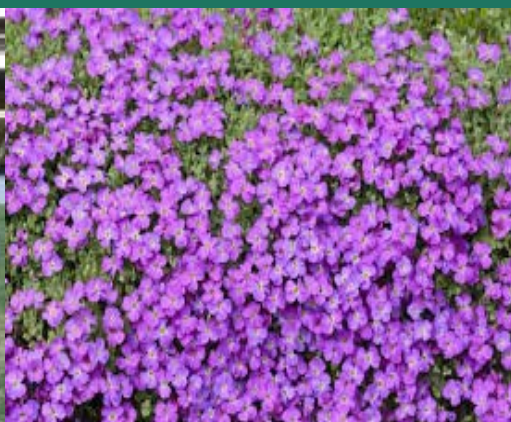
Rockcress ( Arabis caucasica )