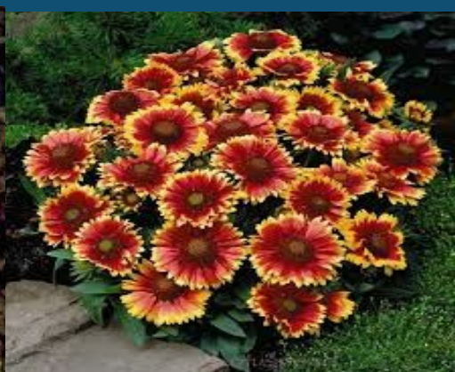
Blanket Flower ( Gaillardia grandiflora )