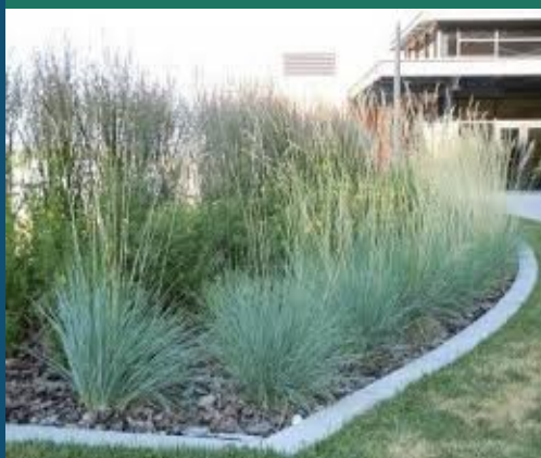
Blue Oat Grass ( Helictotrichon sempervirens )