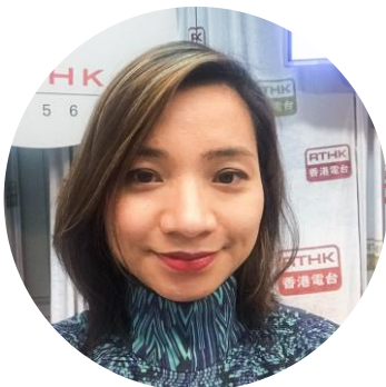
Hai Ahn Vu Island County