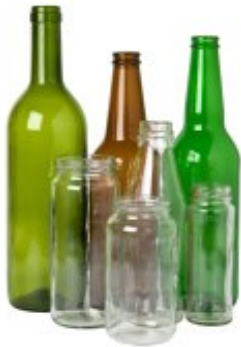
GLASS Bottles & Jars Only (Empty, Rinse, Remove lids)