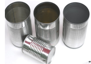
TIN & ALUMINUM CANS (Empty, Rinse)