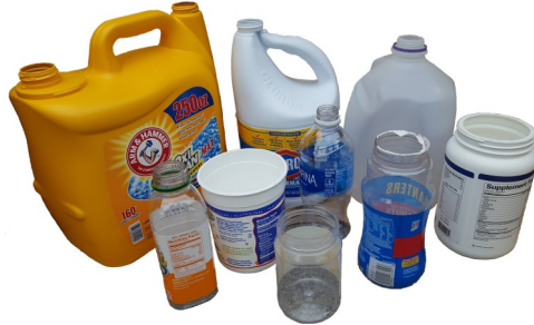
ONLY #1 & #2 PLASTIC Bottles, Tubs, Jugs, Jars (Empty & Rinse. No Caps, No Lids) (NO Toxic Product Containers)