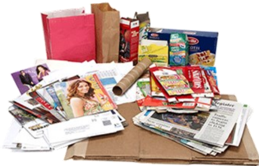
PAPER (Clean, No Food or Other Contaminants)

PLEASE DON'T CONTAMINATE OUR RECYCLING Placing the wrong items in recycling containers creates contamination. Contaminants can damage recycling equipment, cause injury to personnel, degrade the value of commodities, and/or render commodities unacceptable for processing.