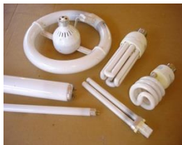
Fluorescent Tubes & Bulbs