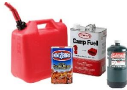
Gasoline & Fuels