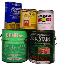
Oil-Based Paints, Stains, & Solvents