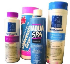
Pool & Spa Supplies

These materials ARE NOT ACCEPTED at the Household Hazardous Waste Collection Facility. Please see back page, www.recyclewhidbey.net or phone 360-679-7386 for more information.