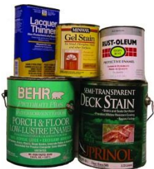
Oil-Based Paints, Stains, & Solvents