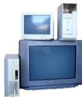
Televisions, CPUs, & Monitors