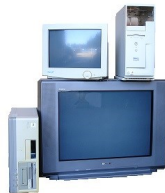
Televisions, CPUs, & Monitors