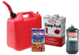
Gasoline & Fuels