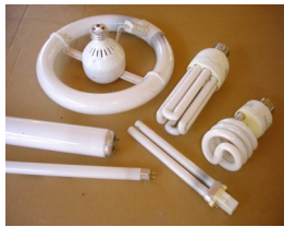
Fluorescent Tubes & Bulbs