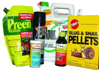
Lawn & Garden Products