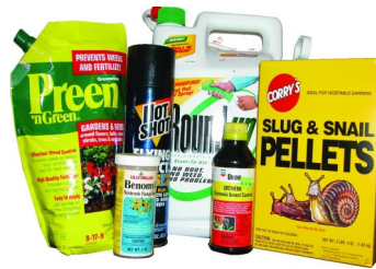
Lawn & Garden Products