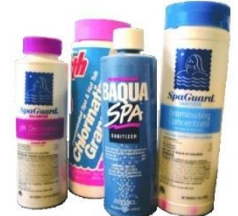
Pool & Spa Supplies

These materials ARE NOT ACCEPTED at the Household Hazardous Waste Collection Facility. Please see back page, www.recyclewhidbey.net or phone 360-679-7386 for more information.