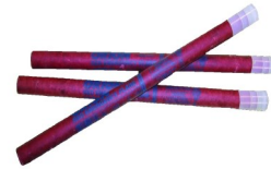
Road & Marine Flares