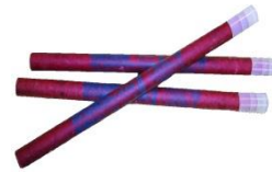
Road & Marine Flares